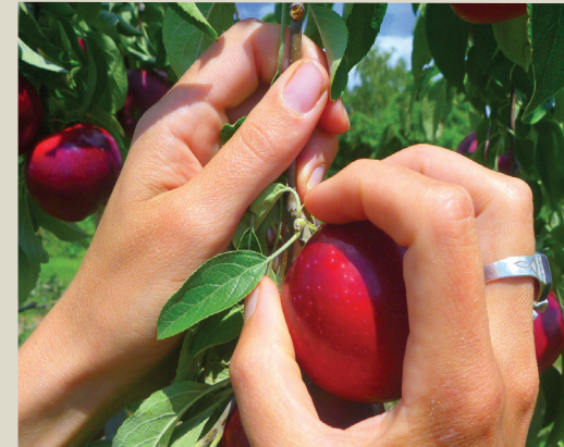
Use two hands to pick fruit.

IMPORTANT: Do NOT hit, shake, pull on, or climb the trees. Fruit trees are fragile, and they are easily damaged or broken. It took us at least 10 years to make these trees!