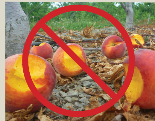
Do not take a bite and discard!

Please do NOT pick peaches and toss them. Peaches are precious!